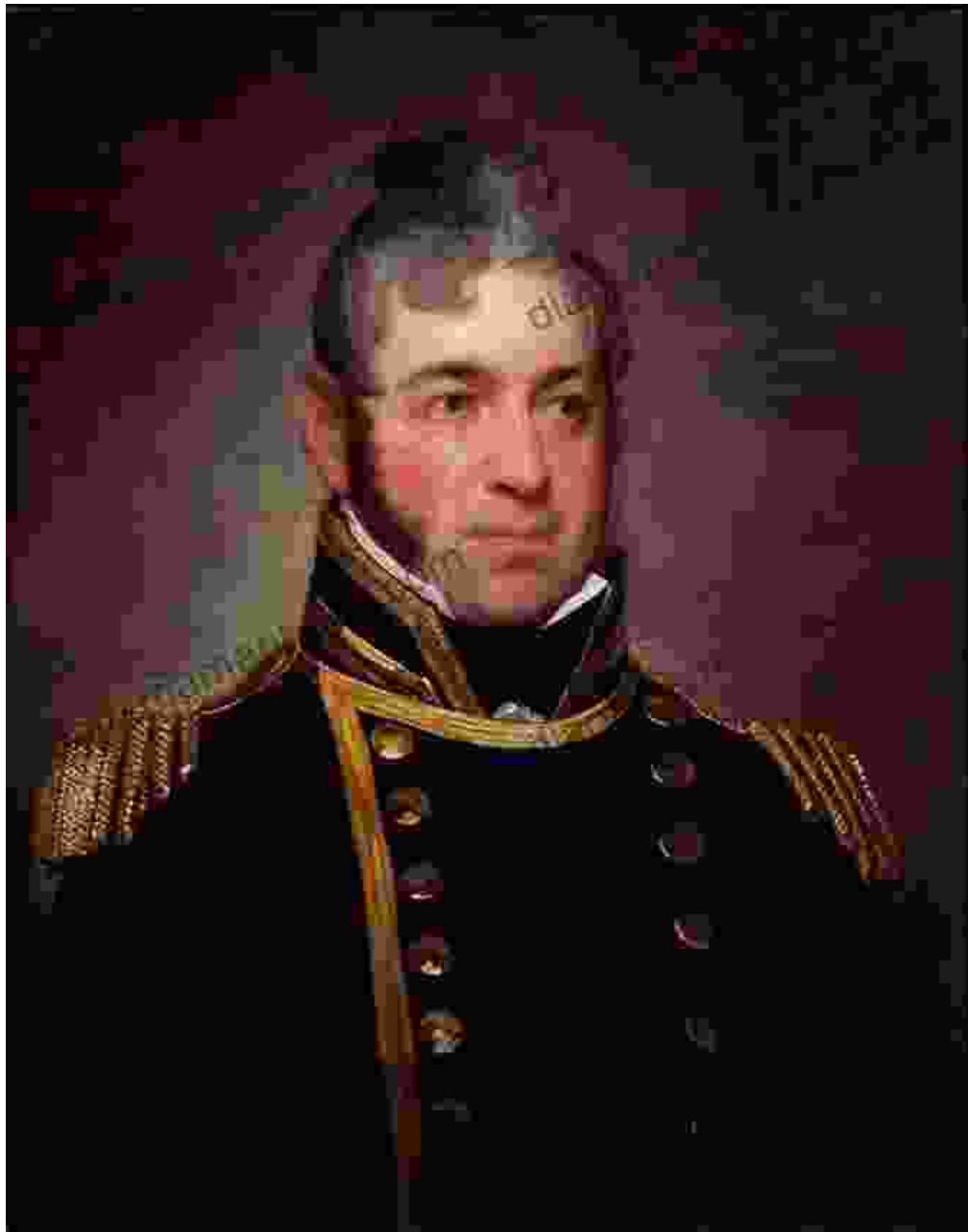
Yusuf Karamanli: The Cunning Ruler of Tripoli

Born in New Jersey in 1774, William Bainbridge embarked on a naval career that would forever etch his name in the annals of maritime warfare. A skilled tactician and fearless leader, Bainbridge rose through the ranks and earned a reputation as a resolute pirate hunter. His unwavering determination to suppress the Barbary pirates, who preyed upon American merchant ships and enslaved their crews, became his defining mission.